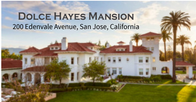
DOLCE HAYES MANSION 200 Edenvale Avenue, San Jose, California