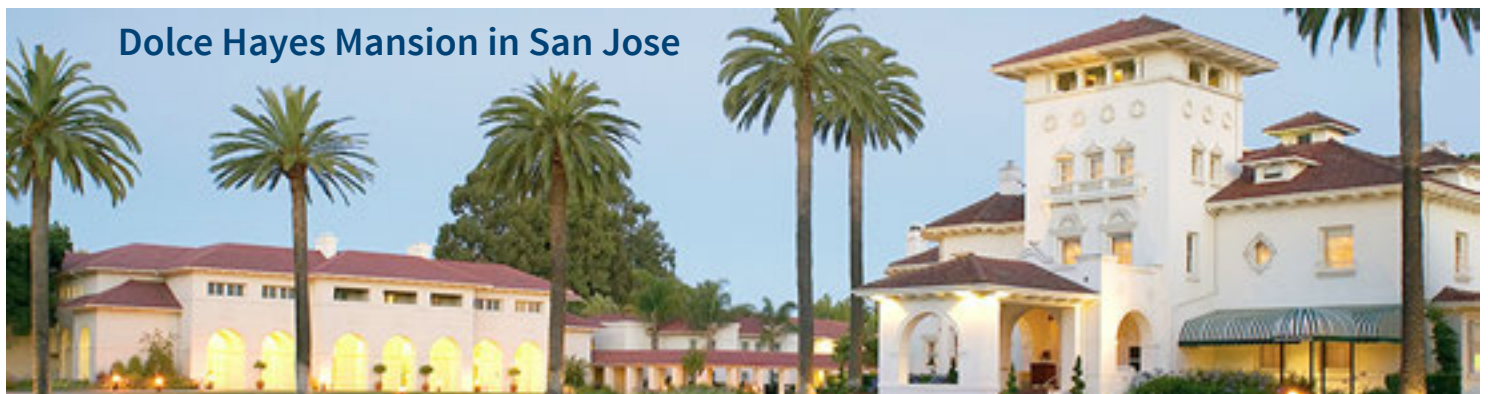
Dolce Hayes Mansion in San Jose