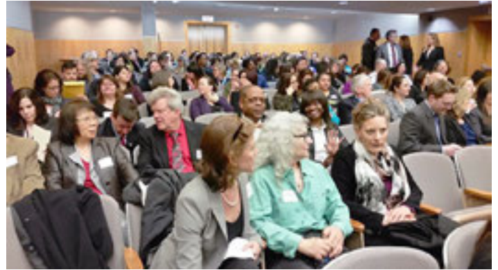
Massage Therapists at March 14, 2016 Calif. Legislature Hearing. State massage therapists attended and testified.