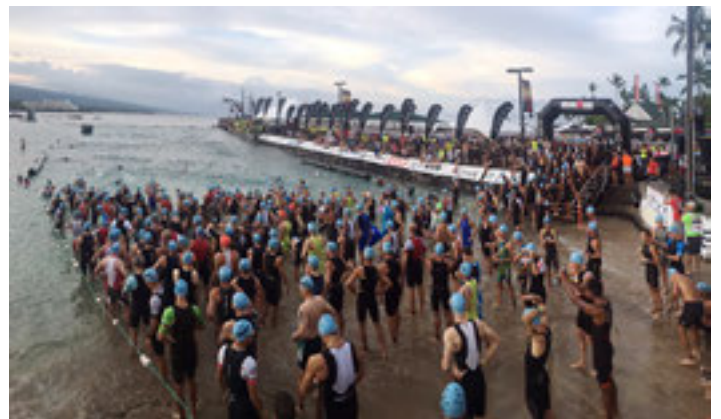
IRONMAN® World Championship in Kailua-Kona, Hawaii

with 85% military services participants, became part of the annual IRONMAN® events in 2015.